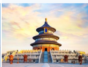
The Temple of Heaven