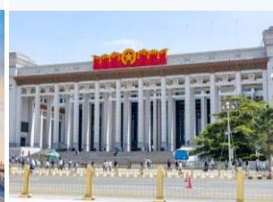
National Museum of China

Reminder: Visiting Tiananmen Square and the Forbidden City requires advance reservations through the official website; otherwise, entry will not be allowed.