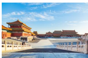
The Forbidden City